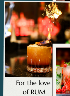
For the love of RUM