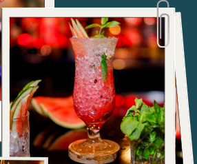
Watermelon Sugar Hi