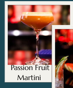
Passion Fruit Martini

(Our offers aren't valid in conjunction with other offers, please check with member of staff)